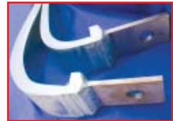
Large DBAL with Cu ends